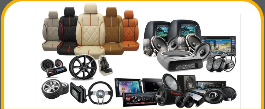
EXCLUSIVE CAR ACCESSORIES