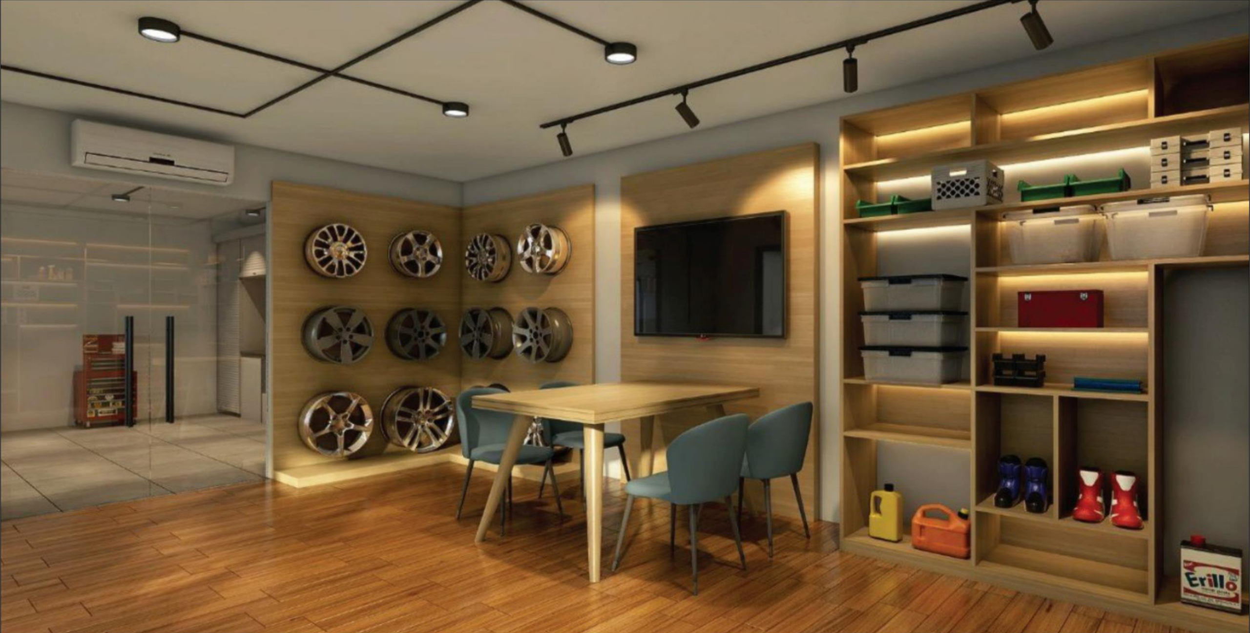
FILSHOPPEE – 3D MODEL INTERIOR DISPLAY