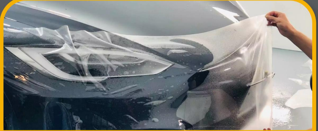
PAINT PROTECTIVE FILM